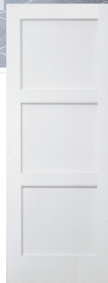
3 PANEL EQUAL SHAKER Smooth Square