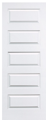
5 PANEL Smooth Bead & Cove