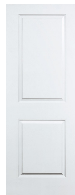
2 PANEL SQUARE TOP Smooth Bead & Cove