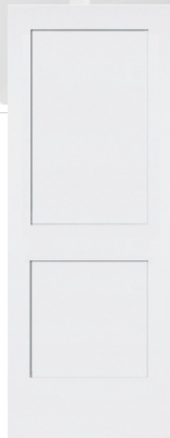
2 PANEL SHAKER Smooth Square