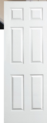
6 PANEL Smooth/Textured Bead & Cove