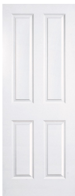
4 PANEL Smooth Bead & Cove