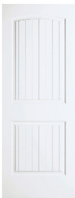
2 PANEL PLANK ROUND TOP Smooth Ovolo