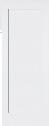
1 PANEL SHAKER Smooth Square