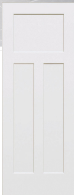
3 PANEL T SHAKER Smooth Square