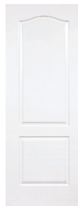
2 PANEL ARCH TOP Textured Bead & Cove